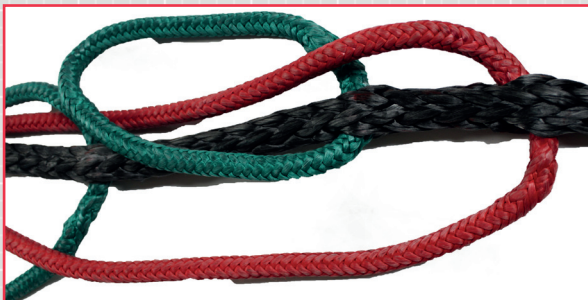
SPIE DPX – HMPE 12 STRAND BRAIDED MAIN ROPE