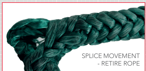
SPLICE MOVEMENT - RETIRE ROPE