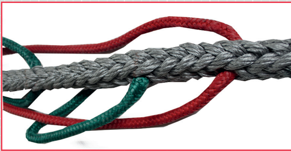
SPIE WPX – POLYOLEFIN 12 STRAND BRAIDED MAIN ROPE