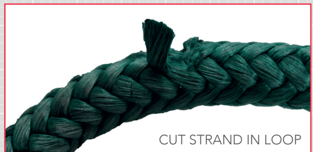
CUT STRAND IN LOOP

WHERE A LOOP IS RETIRED IT MAY BE CUT AND REMOVED FROM THE MAIN ROPE. THE REMAINDER OF THE ROPE MAY CONTINUE TO BE USED.