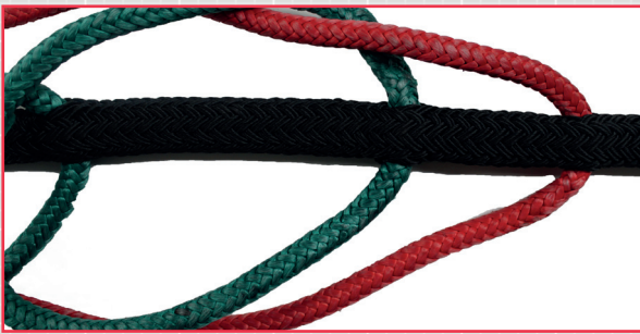
SPIE – POLYESTER DOUBLE BRAIDED MAIN ROPE

This document is applicable to all versions of the SPIE rope: